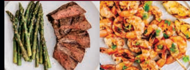
Sirloin steak & asparagus

Best for cooking thick cuts of meat or frozen protein.