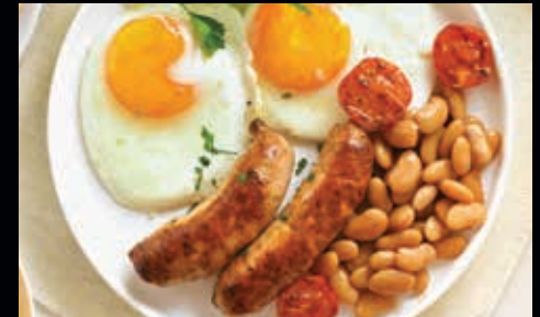
Even edge-to-edge heating