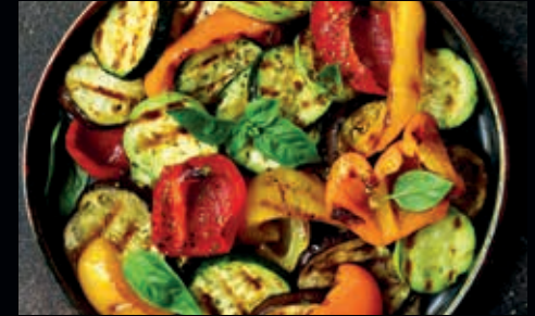
High-heat cooking up to 260°C