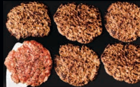
Large cooking capacity for family-sized meals