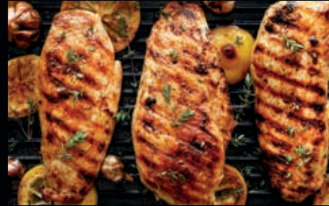
Authentic char-grill marks

High heat gives you the sear and grill marks you crave without overcooking. No hot spots. No cold spots. Just even cooking from edge to edge for juicy, sizzling dishes every time.